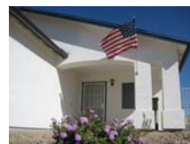
LEED Silver Certified Sub- division, Apache Junction Developer: Habitat for Humanity Central Arizona