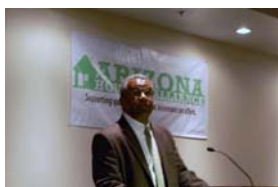
Ron Sims, Deputy Secretary, U.S. Department of Housing and Urban Development, speaks at 2009 annual meeting about making neighborhoods stronger and more sustainable.

Partnered with the Arizona Foreclosure Prevention Task Force to help shape the state's Hardest Hit Fund.